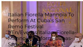
Italian Fiorella Mannoia To Perform At Cuba's San Remo Festival ( /en/events/italian-fiorella-mannoia-perform-cubas-san-remo-festival )