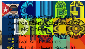
Cuba's Music Festival And Awards Event Sub-discos To Be Held Online ( /en/events/cubas-music-festival-and-awards-event-sub-discos-to-be-held-online )